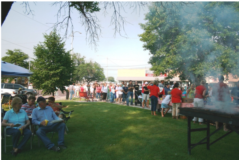
Over 500 people celebrated the Foundation's 20th Anniversary with a free BBQ.

Through the awards of grants and scholarships, the Foundation has been able to help many charities, individuals and communities throughout Custer County. While it is true that everything changes, most core values remain the same. The Custer County Foundations remains committed to its motto: Preserving Our Heritage... Planning Our Future."